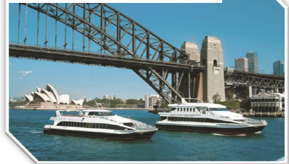
Simply Magistic & Magistic Two