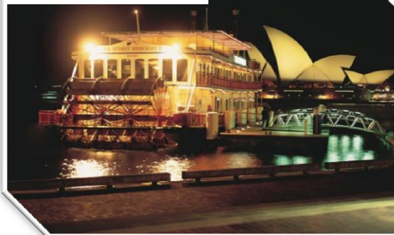
Sydney Showboat II